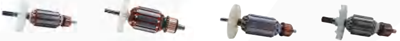
PBA 2-26 PBA GST65E PBA 4SB PBA PH65A