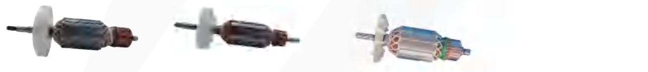
PBA 18SE2 PBA 801 PBA160M