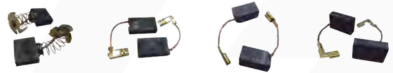
CB-204 BK45 BK20/DW801 CB-325